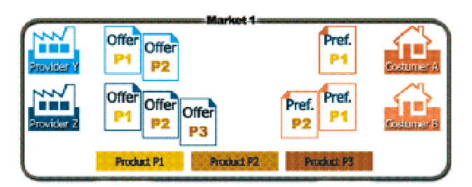
Figure 1. Main components in the market model